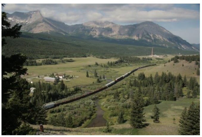
A major freight mainline runs through the region linking British Columbia and Port Metro Vancouver to a major freight handling facility in Lethbridge.

Products can be shipped by rail on the Canadian Pacific Railway mainline. Lethbridge boasts a major freight handling facility, with tracks running in all four cardinal directions. Products are easily shipped north to Calgary, south to the U.S.A., east to large markets in southern Ontario, and west to Vancouver and beyond to the Pacific Rim.