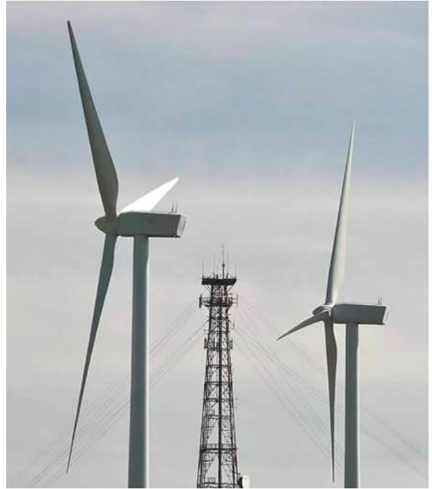
Southwest Alberta wind turbines in action.

Local businesses depend on a highly skilled and specialized workforce to run and operate the many wind farms. Lethbridge College's International Wind Academy, the only post-secondary institution in Canada approved to deliver BZEE certified wind turbine programming, is only 100 to 150 kilometres away and sets the current world training standard.