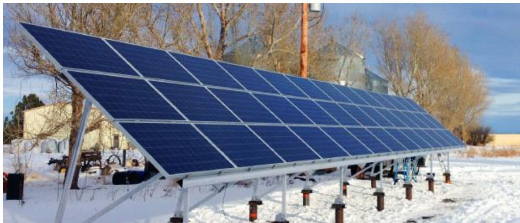
9.36 kW Conergy 240 watt solar module, Lethbridge, Alberta, SkyFire Energy.

Opportunities in the region include the expansion of the manufacturing industry for solar equipment, creating new solar farms to supply electricity to the grid or partnering with research groups prominent in the area to craft new technologies.